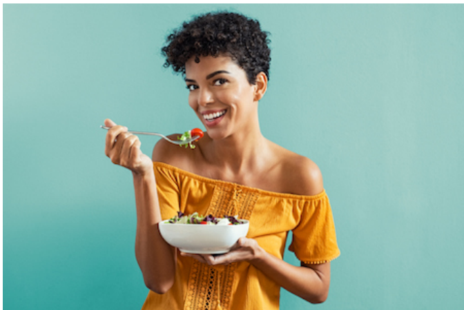
Grammar Talks 2-08 | Transitive Verbs